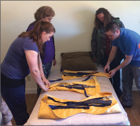
Staff training at Residential Care Facility for the Elderly (RCFE)

Parents and Friends is proud to have opened its first Residential Care Facility for the Elderly (RCFE), Azalea House, in Fort Bragg last year. The RCFE is a state-licensed facility that provides around the clock support to 4 residents, and employs 15 community members. The Redwood Coast Regional Center has been instrumental in assisting PFI to provide this specialized supportive service in order to meet the needs of people