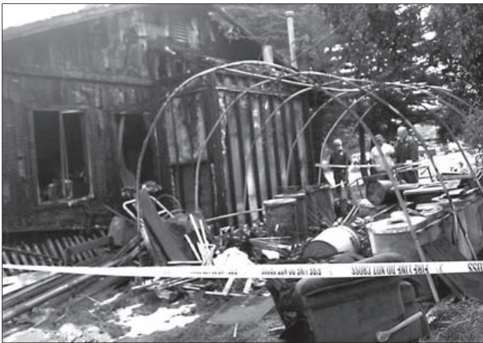
The fire started in a storage shed behind the Furniture Annex on Cypress Street.

On September 6, a fire started at the back of the Furniture Annex recycled furniture store operated by Parents and Friends at 350 Cypress Street. The cause of the fire is unknown but it's believed it was started by a transient seeking shelter and starting a fire for warmth that got out of hand. PFI is grateful the hospital security personnel noticed and reported the fire.